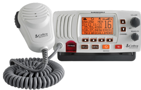
MR F57W *Available In Black