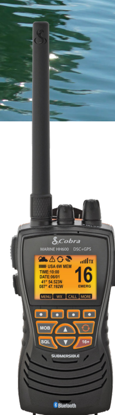
MR HH600 *Available In White