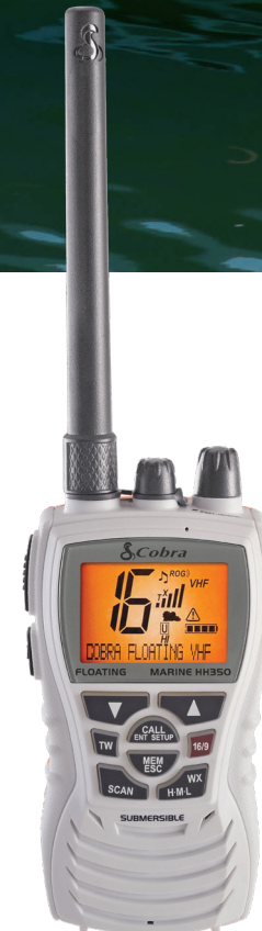
MR HH350W FLT *Available In Gray