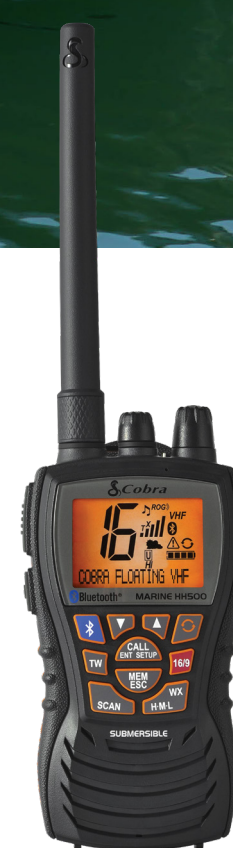
MR HH500 FLT BT