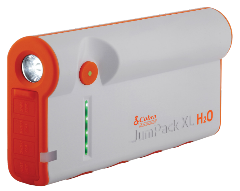
Cobra Marine JumPack H2O