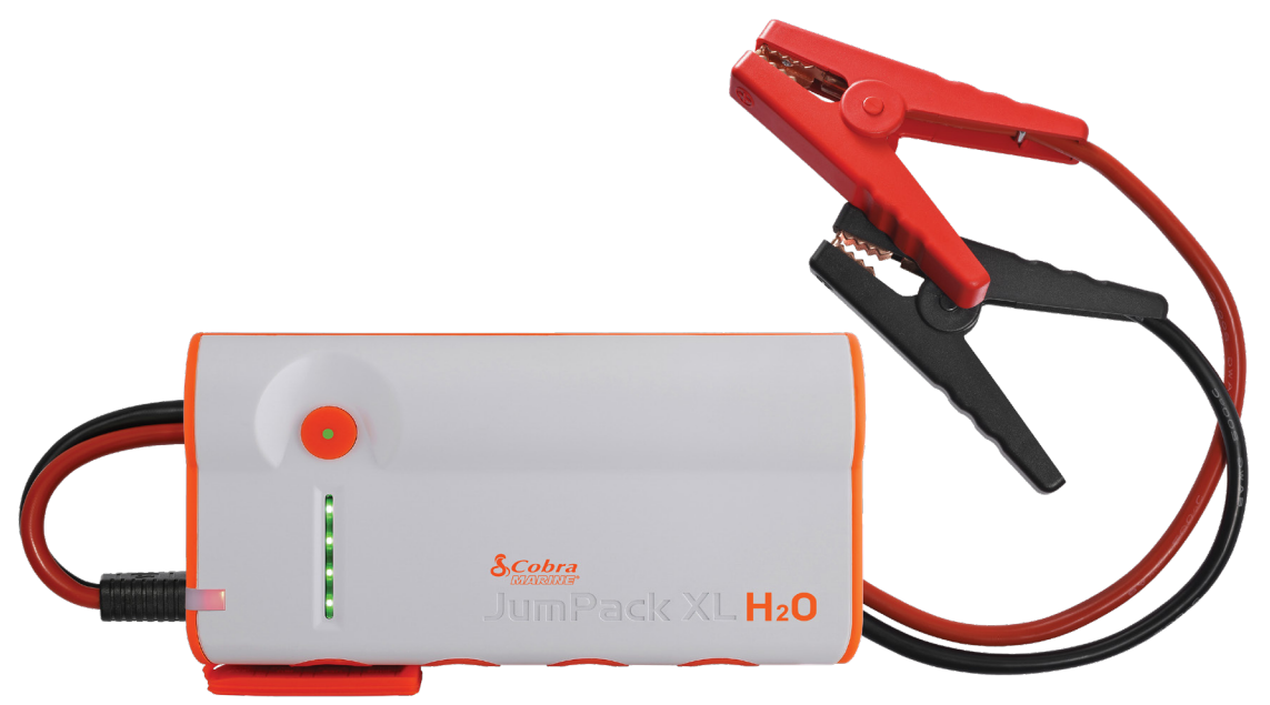
Cobra Marine JumPack H2O