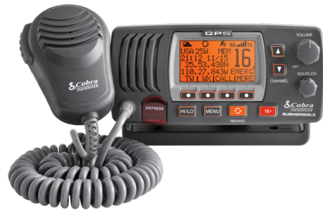
MR F77B *Available In White