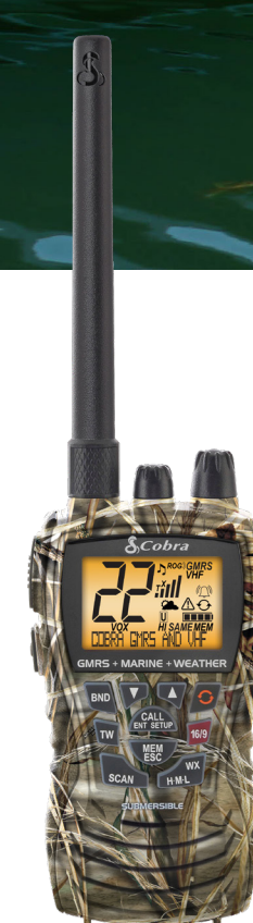
MR HH450 CAMO *Available In Black