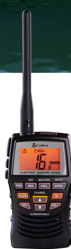
MR HH150 FLT